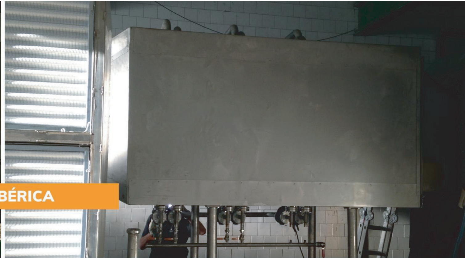
SPRAY DRYER - QUESERÍA IBÉRICA