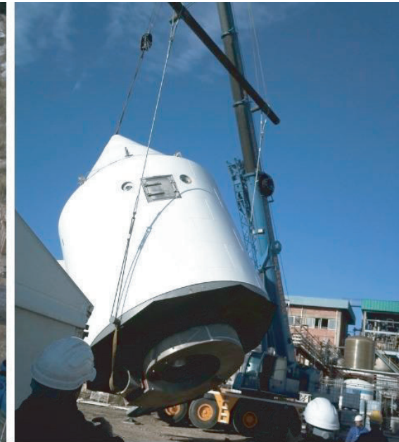
SPRAY DRYER - ALCOVER QUÍMICA SL